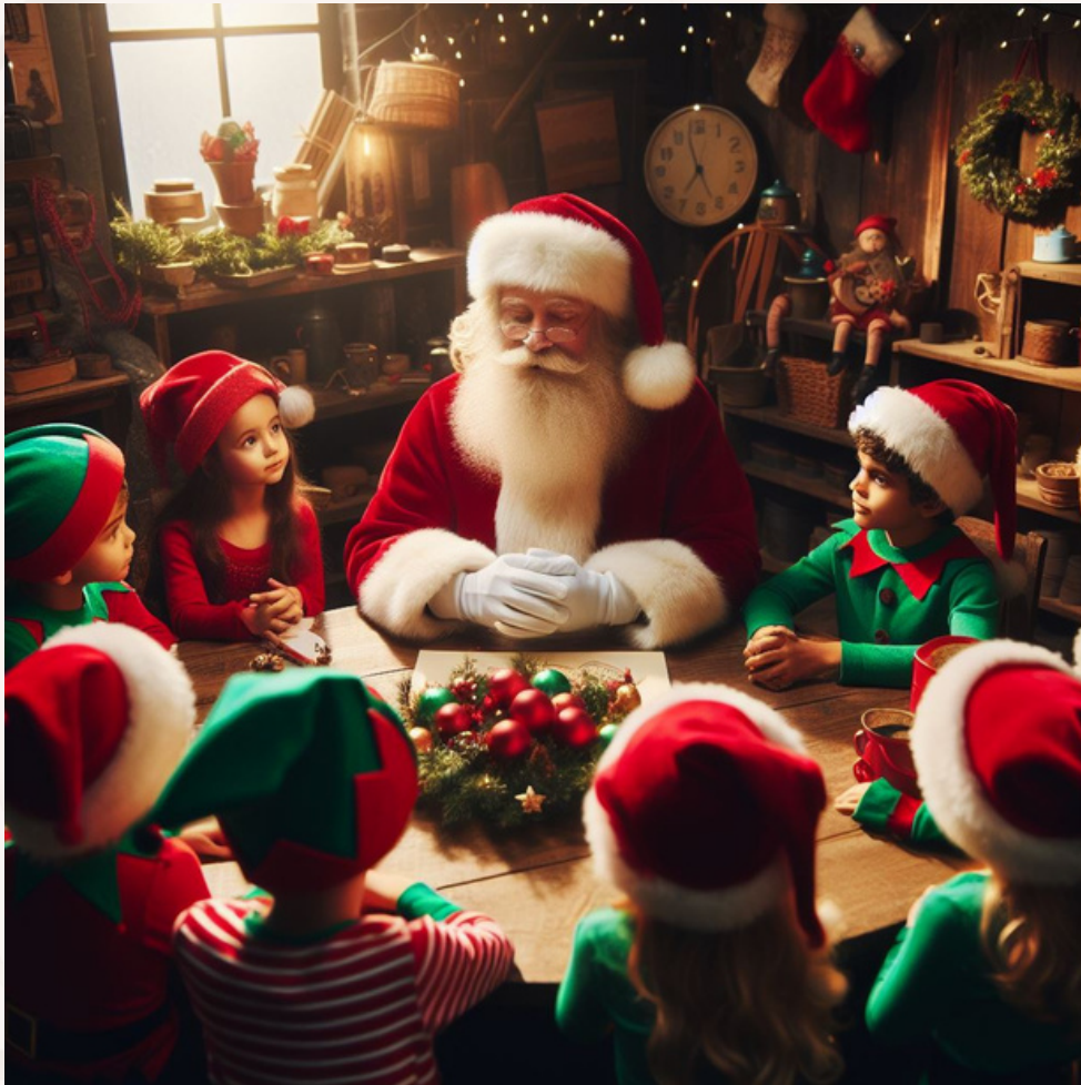
Photograph: Mr. Claus convening with department heads

maintains a positive and festive environment all year round, crucial as Christmas decorations are an important part of elf culture. Each of these committees holds special importance within the social fabric of the North Pole, underscoring the importance for Santa to hear and consider them all when making decisions. To facilitate this, the council convenes once a month to discuss important issues within their respective domains and relay these decisions to Mr. Claus. Starting in December, council meetings occur on a weekly basis.