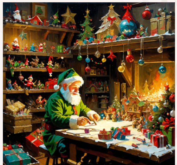
A young toy designer hard at work

The vast majority of elves spend their days toiling away in the Christmas Workshop, which is situated in the centre of the city. Their days comprise of song, work, and sweet little treats, all of which culminate in the great products that make up the magic of Christmas. General labourers, singer-songwriters, designers, painters, and marshmallow tasters: all have a role to play in bringing joy to children worldwide. Their cohesion is ensured by the Workshop Manager, an elf that exhibited great leadership skills, innovation, amicability, and insight. This role is highly demanding, but,